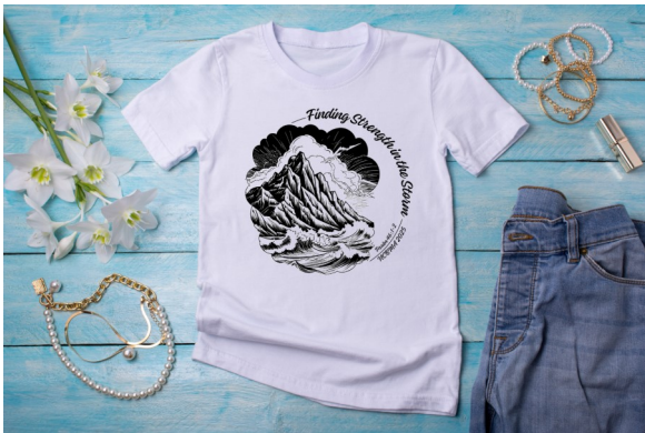
This is only a mock up and not an actual representation of what the shirt will look like.

We will be returning to the Asheboro area this year as we gather together, on November 3-5, at Caraway Conference Center. We appreciate those who have already sent in their registration forms and deposits/payments. Early registration is encouraged, especially for those requesting a private room, as rooms are assigned on a first come basis. If you don't have the full amount available yet, a $50 deposit will hold your spot. You can pay the remaining balance, at your convenience, as long as it is paid in full by August 31. T-Shirts will be available for purchase again this year. In order for the T-Shirts to be available at the conference, the size and sleeve length (short or long), along with payment, will be needed when registrations are due. If you are unable to attend this year's conference, you can still be a part of the NCBMA by sending in an annual membership fee of only $30. This will help with the administrative costs of the NCBMA. As a reminder, only active members qualify to serve as future officers.