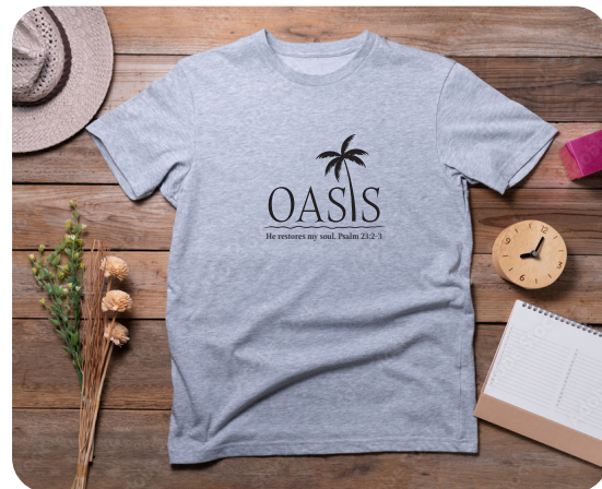
This is only a mock up and not an actual representation of what the shirt will look like.

This year, we will get to enjoy the beauty of the ocean as we gather together, on November 11-13, at Caswell Conference Center on Oak Island. A big THANK YOU goes to those who have already sent in your registrations and deposits. Early registration is encouraged, and a $50 deposit will hold your spot. You can pay off your remaining balance, at your convenience, as long as it is paid in full by August 31. There are a limited number of rooms available in the Smith Conference Center. Those rooms are assigned on a first come basis. Once it is full, the Palmetto and Oleander buildings, which are across the parking lot from the conference center, will be used as needed. Also, please note that T-Shirts are available for purchase this year. The size and sleeve length (short or long) are needed, along with payment, before the order can be placed. If you are unable to attend this year's conference, you can still be a member of the NCBMA by sending in your annual membership dues of only $30. This helps with the administrative costs of the NCBMA. As a reminder, only active members qualify to serve as future officers.